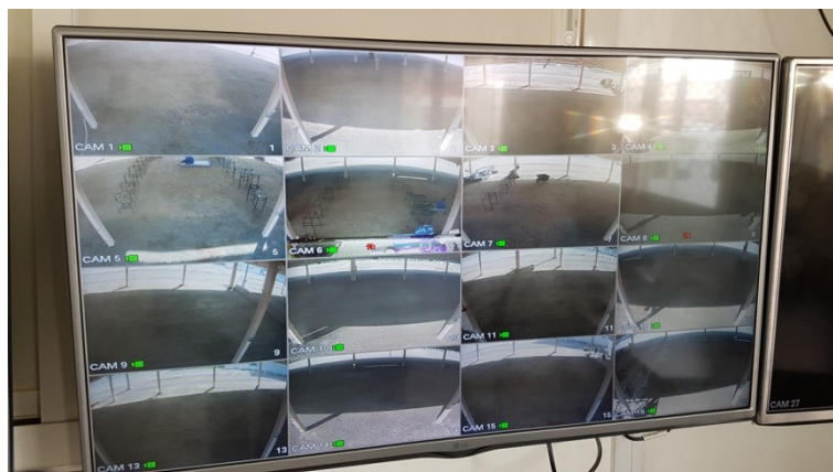
7. Display screens in the control room.

In the control center the person in charge can zoom on any image in case of necessity and everything is recorded for a possible after check.