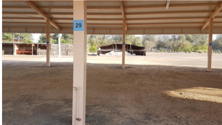
5. Numbered spaces to get a better distribution of the horses.

The first enforcement of this policy on January 5 th and 6 th was not exactly a full success. This is why during the events to come the stables will be assigned to numbered zones and will not have the possibility to choose where they wish to stay. This will lead to a better distribution.