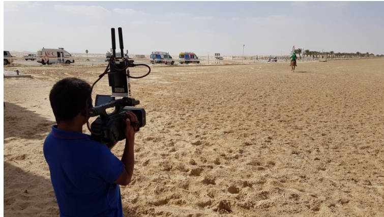
2. Live TV broadcasting through Internet.

"traditional" TV process which is heavier to handle, more expensive and has less geographical extent than what the Internet network easily provides. The rides of January 5 th and 6 th 2017 were a successful test of that mode.